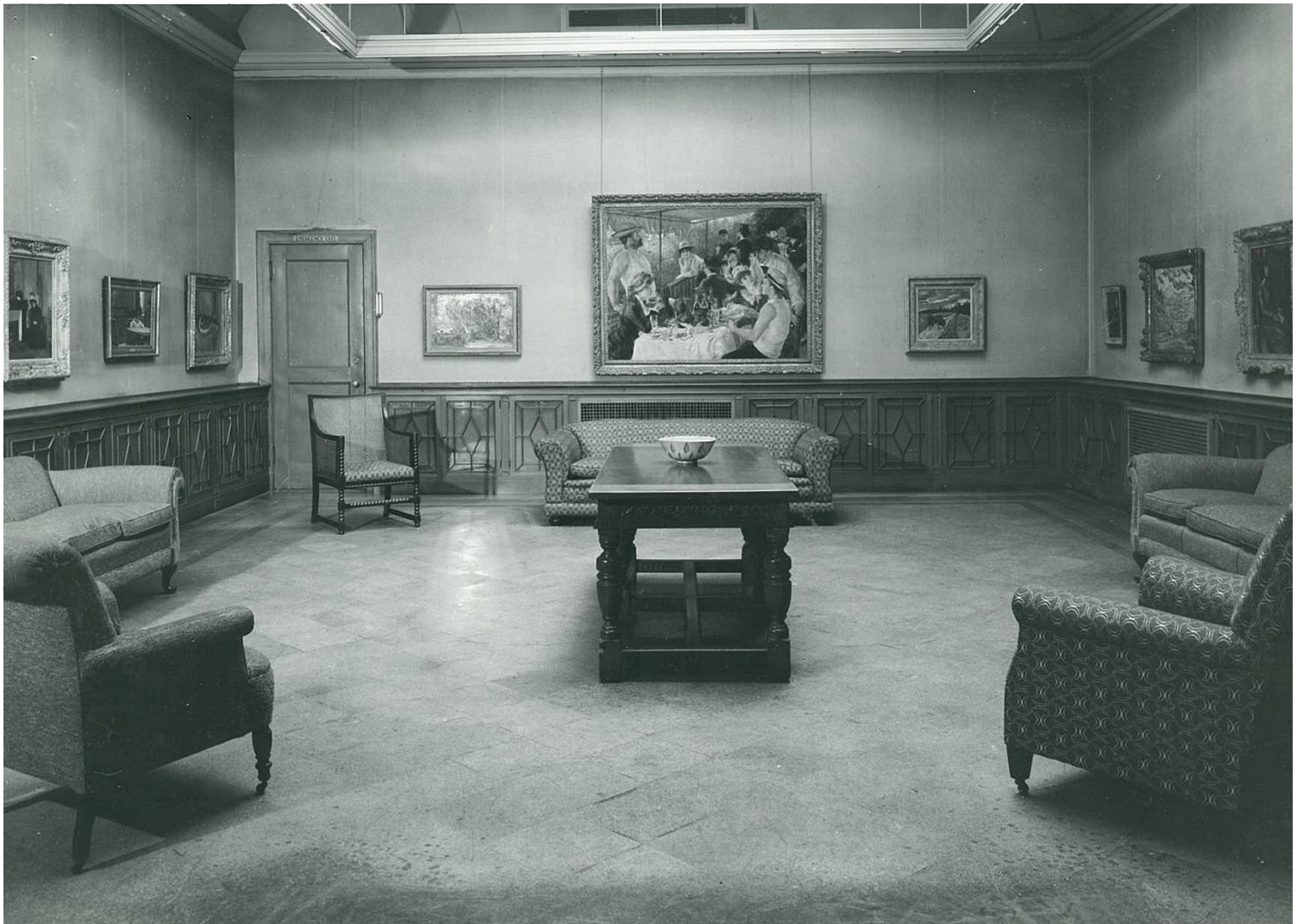
BOTTOM: The Main Gallery in 1941