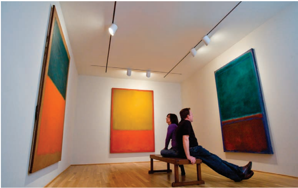
CLOCKWISE: The Rothko Room, The Laib Wax Room, Victor Ekpuk's centennial commission in the lobby; Pierre-Auguste Renoir's Luncheon of the Boating Party , Jacob Lawrence's Migration Series