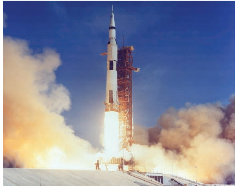
NASA, Apollo 11 launch, 1969, space.com