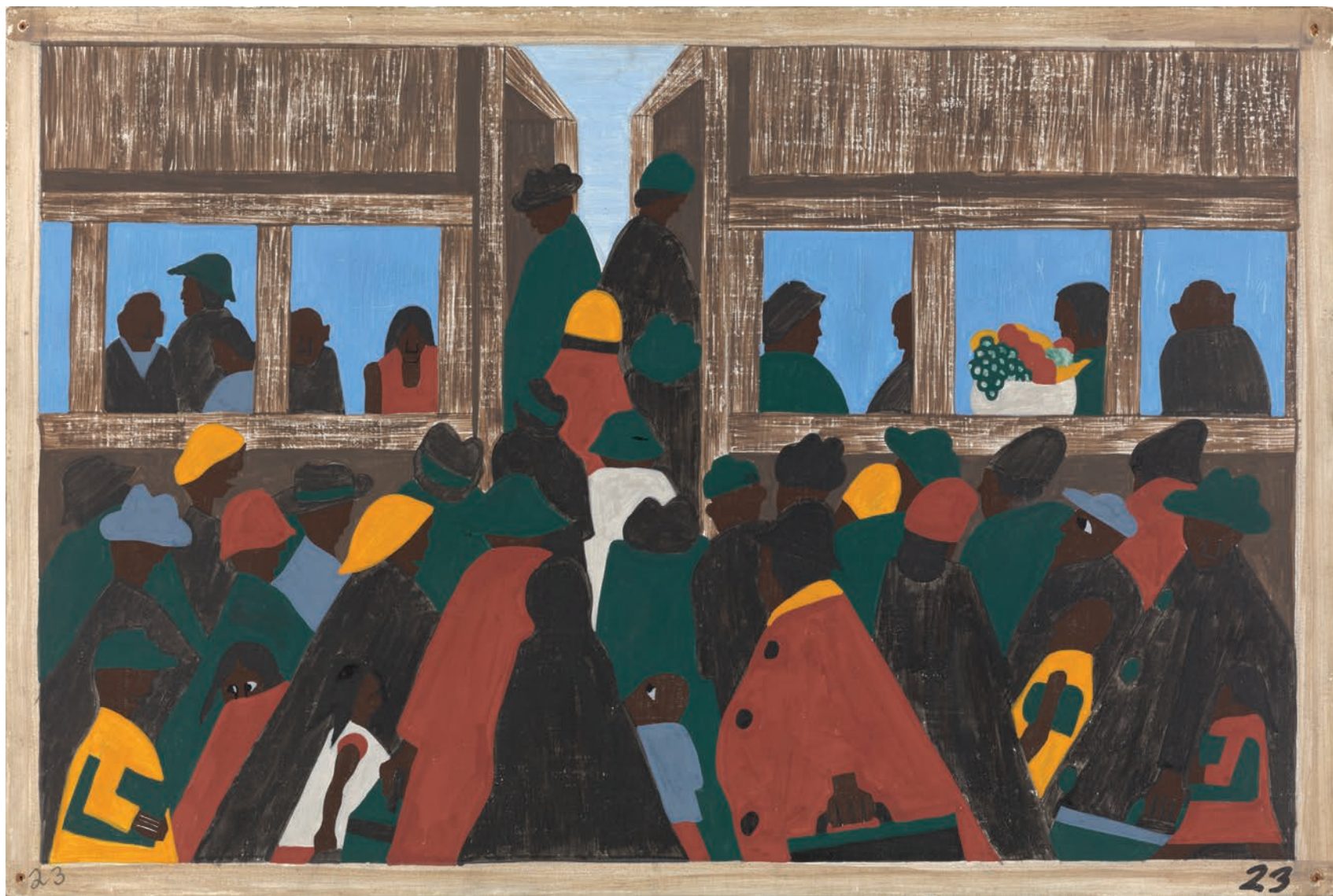
Jacob Lawrence, The Migration Series, Panel no. 23: The migration spread.