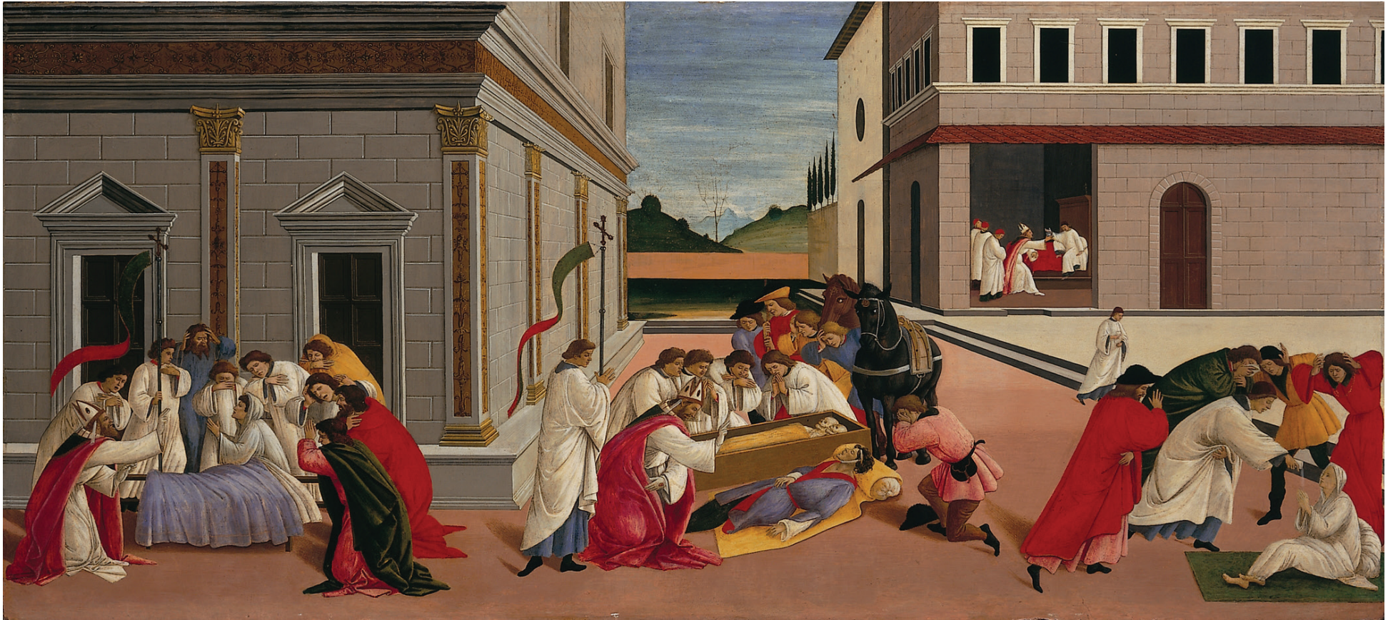
Sandro Botticelli (Alessandro di Mariano Filipepi), Three Miracles of Saint Zenobius

26 1/2 x 59 1/4 in., The Metropolitan Museum of Art, John Stewart Kennedy Fund, 1911, New York