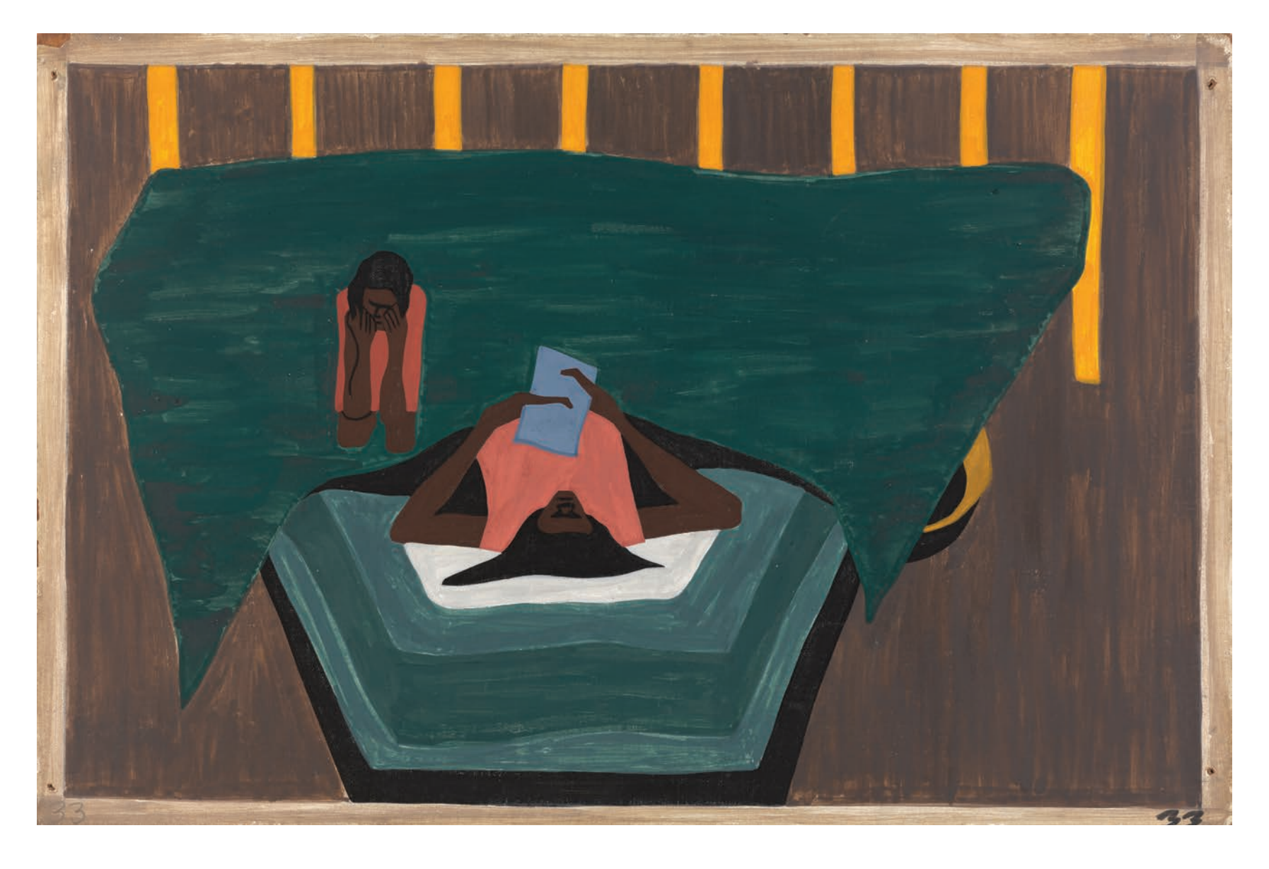
Jacob Lawrence, The Migration Series, Panel no. 33: Letters from relatives in the North told of the better life there.