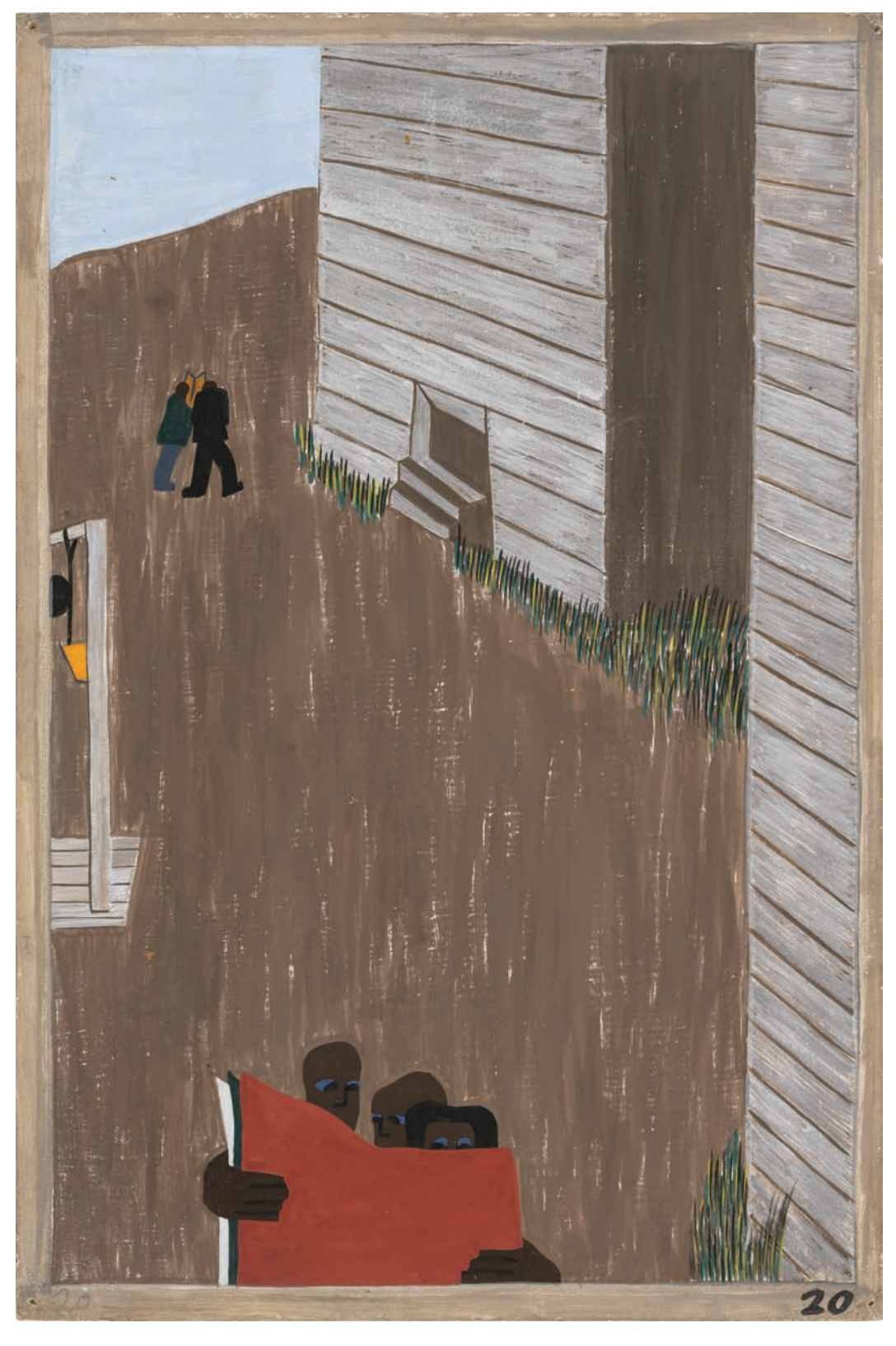
Jacob Lawrence, The Migration Series, Panel no. 20: In many of the communities the black press was read with great interest. It encouraged the movement.