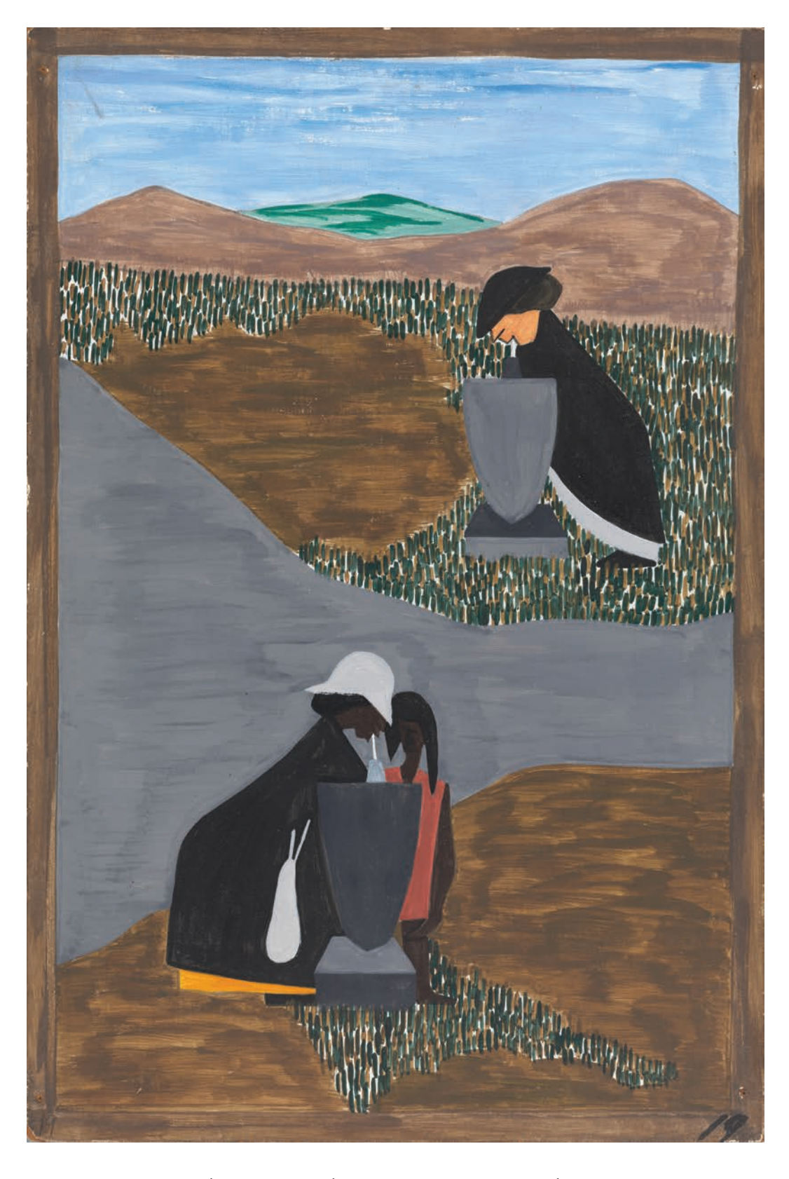
Jacob Lawrence, The Migration Series, Panel no. 19: There had always been discrimination.