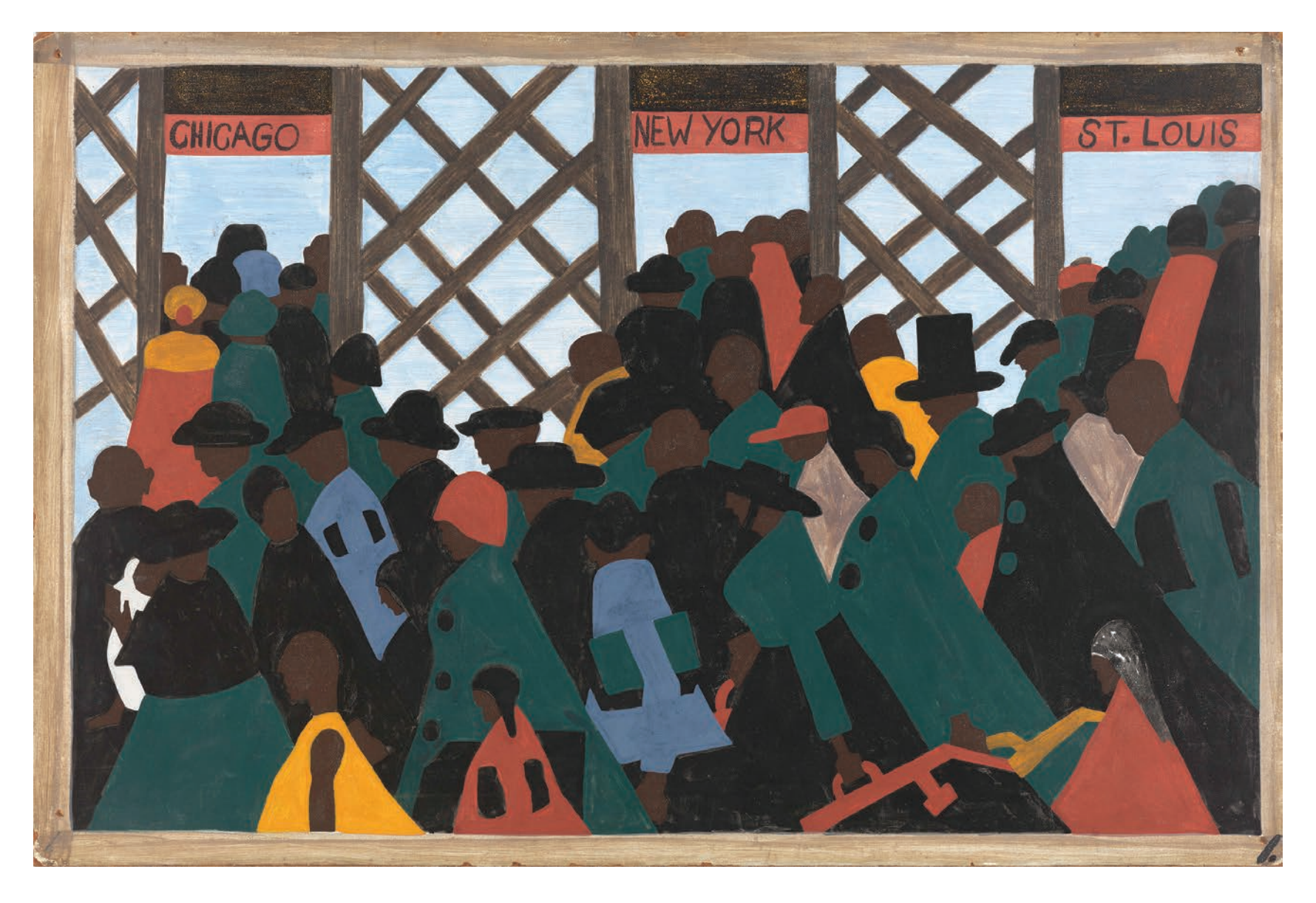
Jacob Lawrence, The Migration Series, Panel no. 1: During World War I there was a great migration north by southern African Americans.