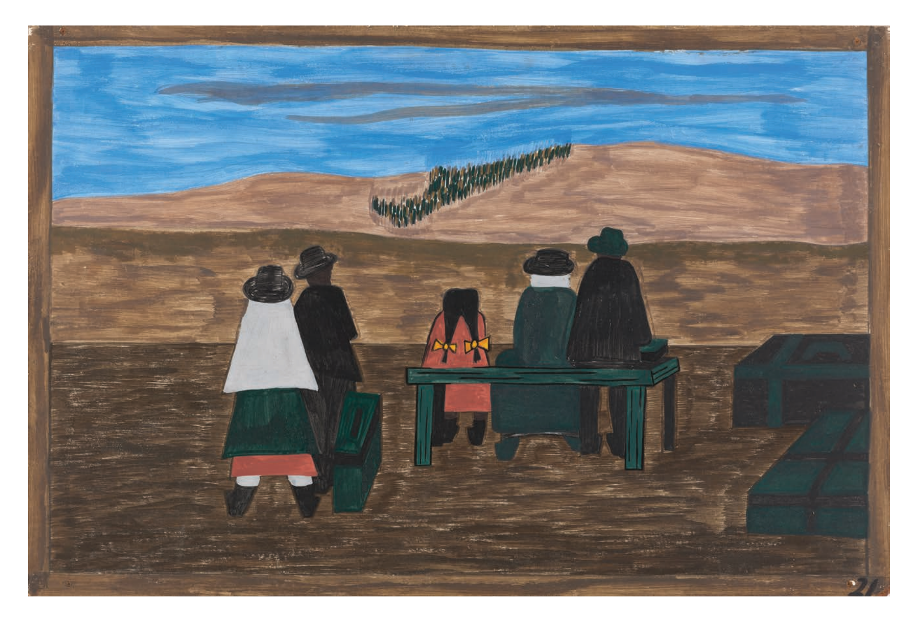
Jacob Lawrence, The Migration Series, Panel no. 21: Families arrived at the station very early. They did not wish to miss their trains north.