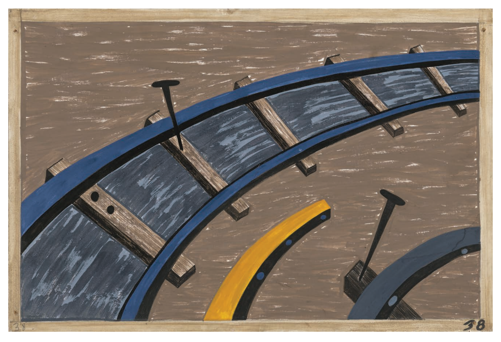
Jacob Lawrence, The Migration Series, Panel no. 38: They also works on the railroads.