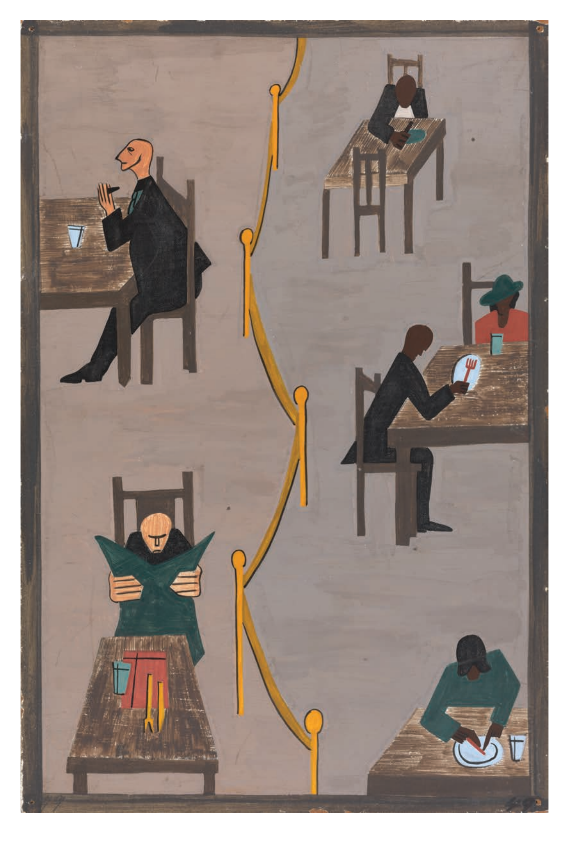
Jacob Lawrence, The Migration Series, Panel no. 49: They found discrimination in the North. It was a different kind.