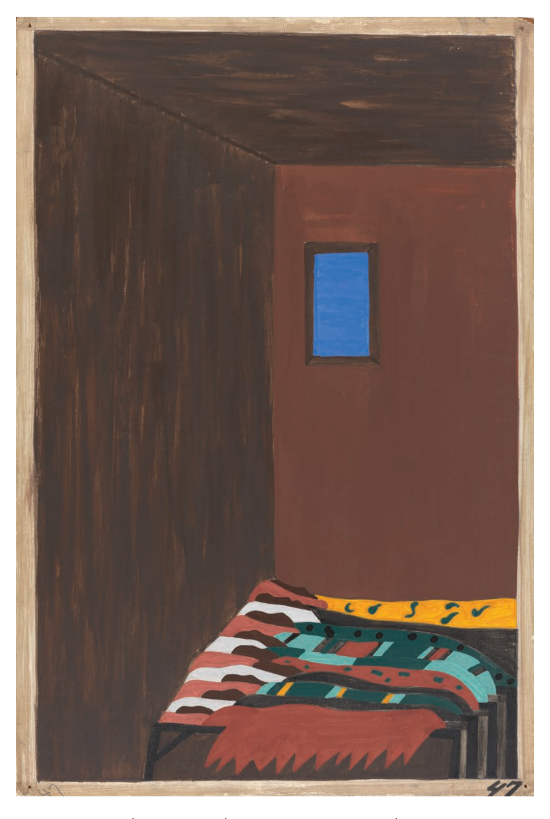
Jacob Lawrence, The Migration Series, Panel no. 47: As the migrant population grew, good housing became scarce. Workers were forced to live in overcrowded and dilapidated tenement houses.