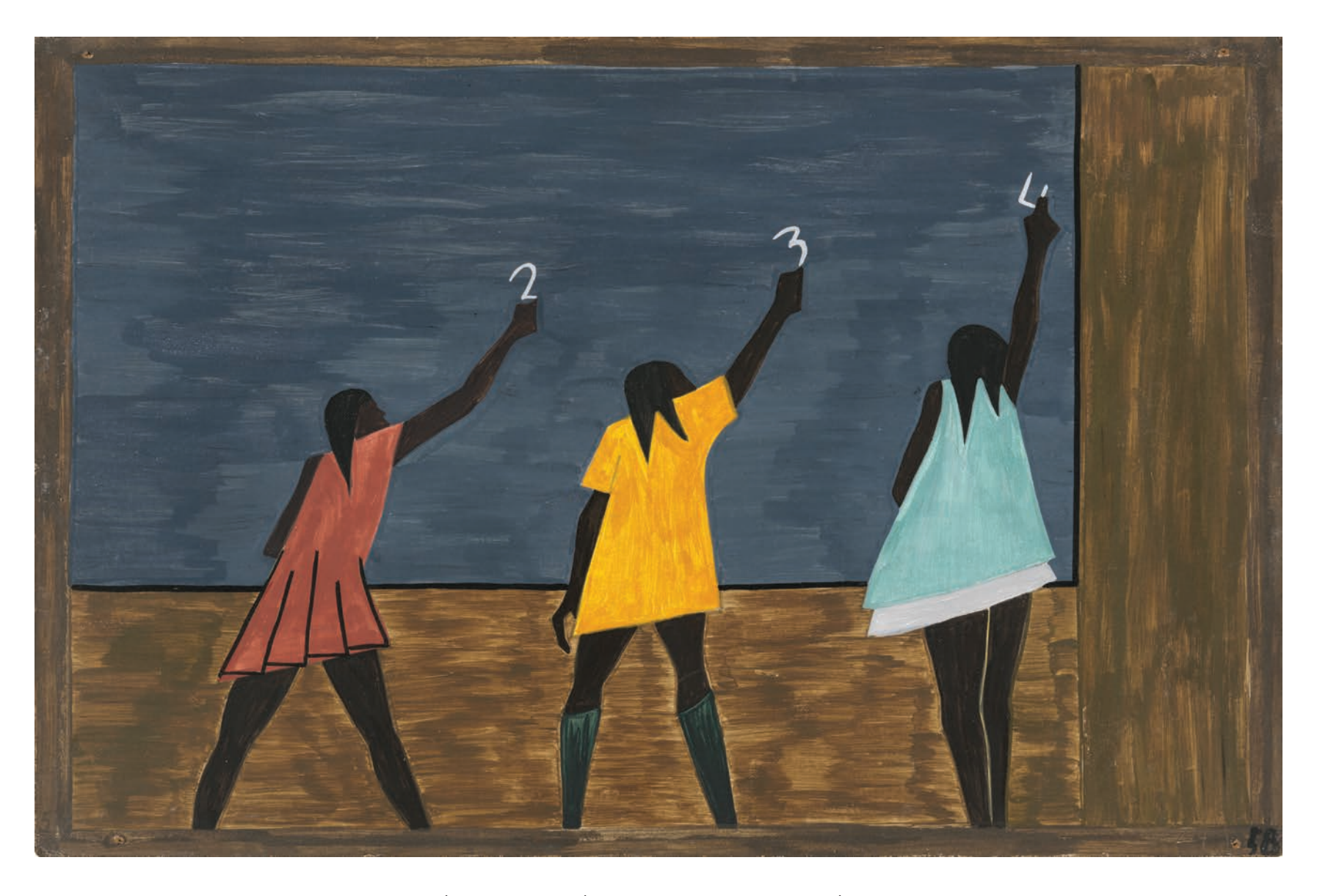
Jacob Lawrence, The Migration Series, Panel no. 58: In the North the African American had more educational opportunities.