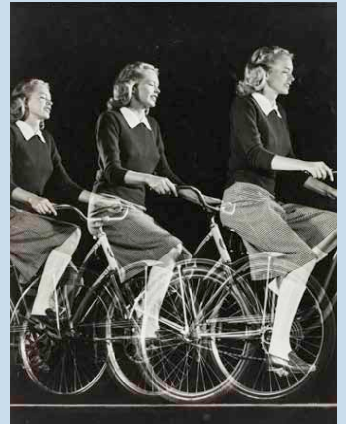
Gjon Mili, Stroboscopic Image of Girl Wearing Culottes, Kneesock and Loafers Riding Bicycle , 1945