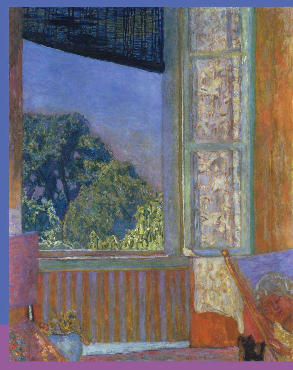
Pierre Bonnard, The Open Window , 1921, Oil on canvas, 46 1/2 x 37 3/4 in., The Phillips Collection Acquired 1930 © 2024 Artists Rights Society (ARS), New York / ADAGP, Paris