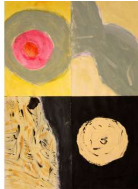
Teach with O’Keeffe, a Phillips Collection initiative, science and art curriculum at the Turquoise Trail Charter School, New Mexico