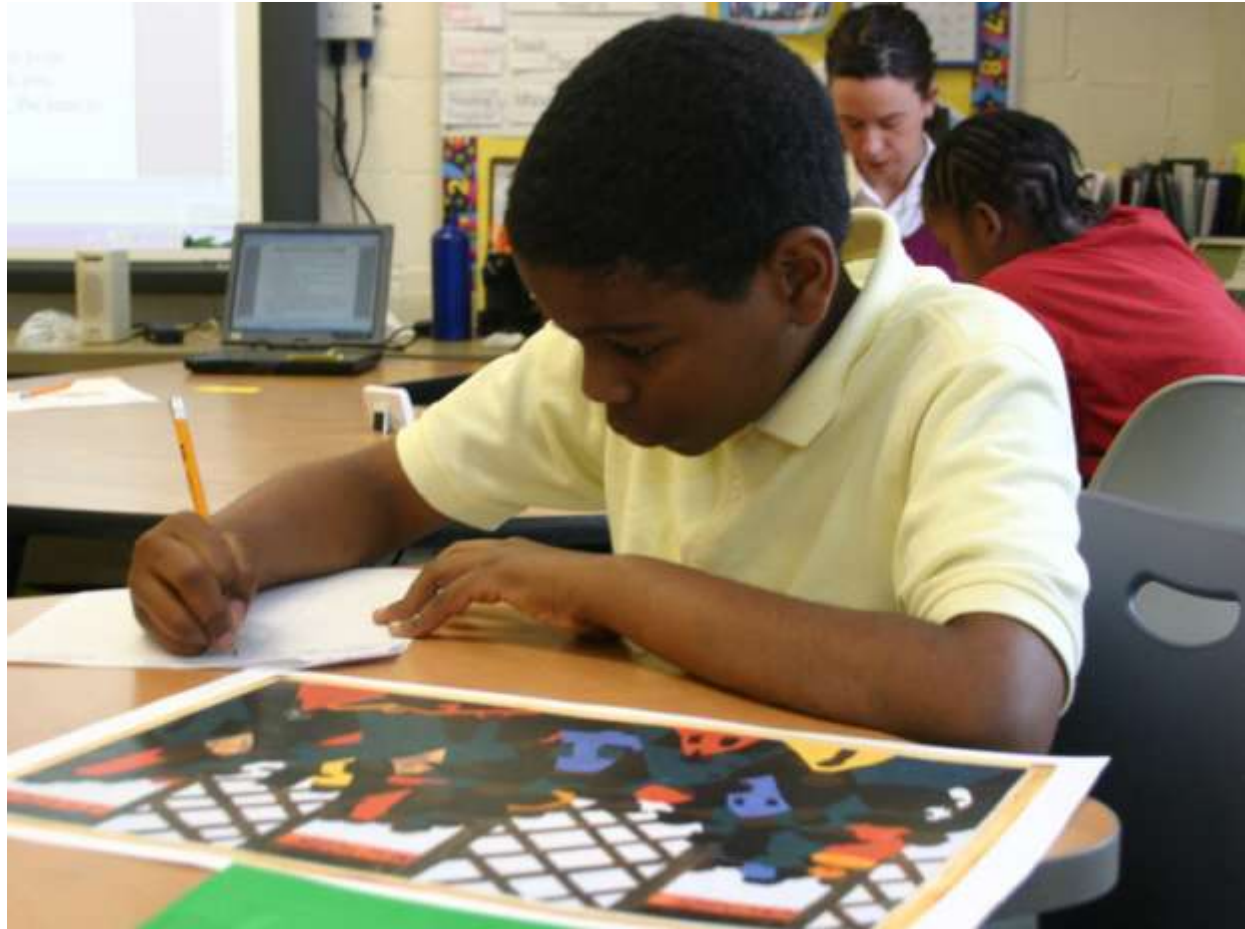
Arts integration happening in the classroom in Washington, DC public schools with Jacob Lawrence's Migration Series . DC student performing rap he wrote, based on study of The Migration Series and the Harlem Renaissance.