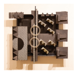
Sondra N. Arkin, Uncanny Valley, 2021, 12 x 12 x 2 ¾ in. Coexist, 2021, 12 x 12 x 2 ¾ in.

David Alfuth, Texture and Shapes No2, 2019, Wood, paper, and plastic, 15 x 12 x 3 in.